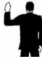
Hit scored for!