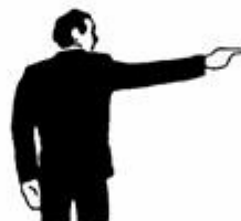
Point in line