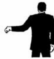
Attack! / Counter-attack!